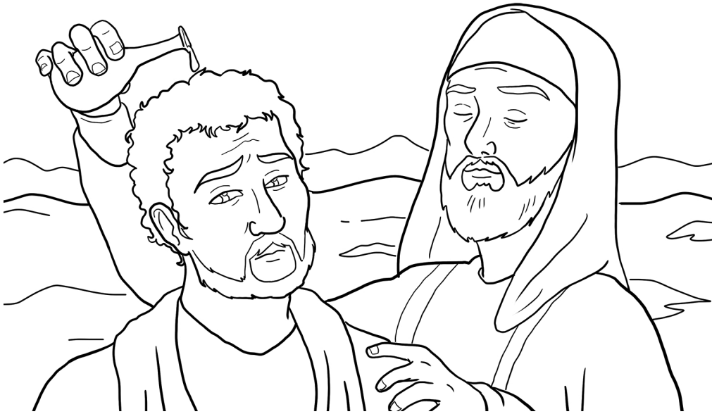
Samuel knew that Saul was chosen by God.

The Israelites decide that they want a king to rule them. Samuel anoints Saul, chosen by God, as king.